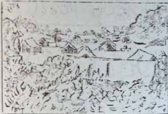
THE TENT CITY